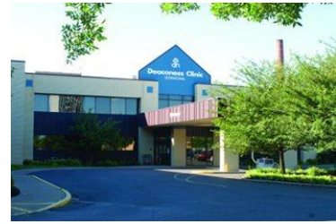
Deaconess Clinic- Downtown