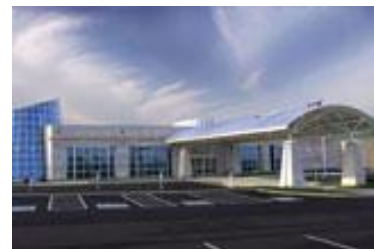
Chancellor Center for Oncology