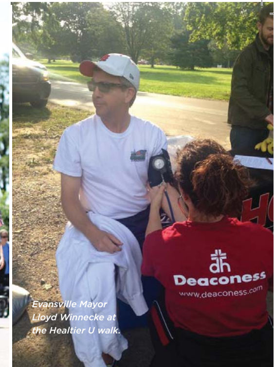
Evansville Mayor Lloyd Winnecke at the Healthier U walk.