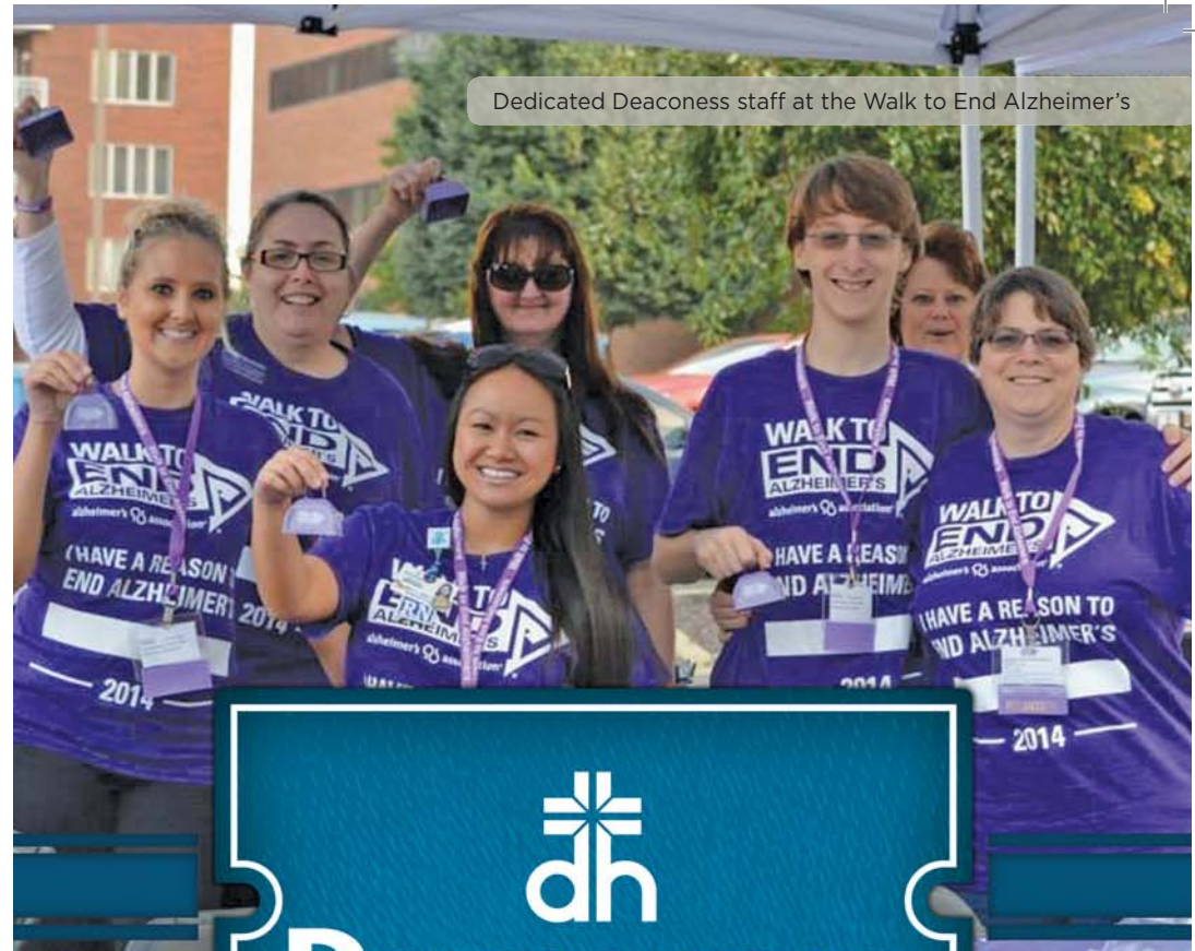
Dedicated Deaconess staff at the Walk to End Alzheimer's