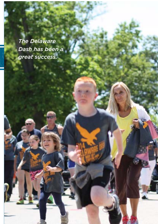
The Delaware Dash has been a great success.

*Charity Care is to be reported on cost basis based on Catholic Health Association (CHA) and VHA recommendations. Medicare is not included based on CHA and VHA recommendation. As of FY07, Cross Pointe is included with Deaconess Hospital.