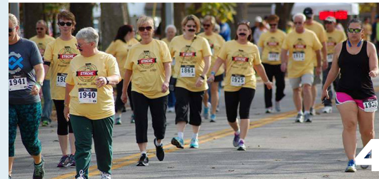
▲ 1. Lung Cancer Vigil; 2. The annual Rotary Santa Run; 3. Wise Choice at the Fall Festival; 4. 2015 Stache Dash